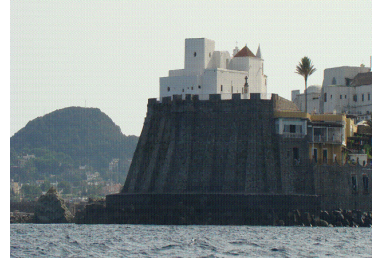
CHURCH OF THE RESCUE FORIO