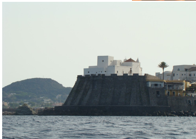
Forio - "Chiesa del Soccorso"